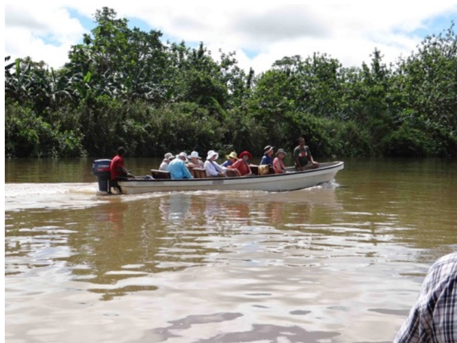
On the Elevara River

Disney ride) into the nearby Elavala River. The Elavala shore has much less slash and burn clearing for the small fruit and vegetable plots than the Fly, which are extensively cleared for crops of breadfruit, pawpaw and bananas. Now and then, there were tiny houses seemingly growing among the remnant forest trees; the gardens overgrown and just starting to be cleared for sweet potato, taro and manioc.