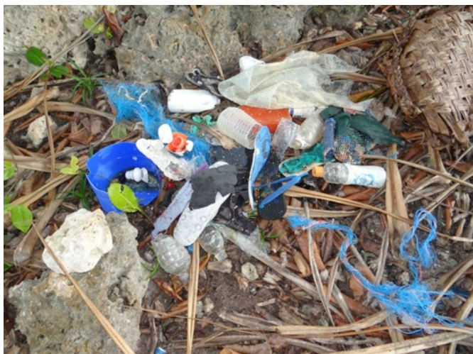
Plastic litter collected from 100 metres of beach

Thus ended a restful day which we all appreciated after high octane activity on Kiriwina Is. And not a trophy seller in sight!