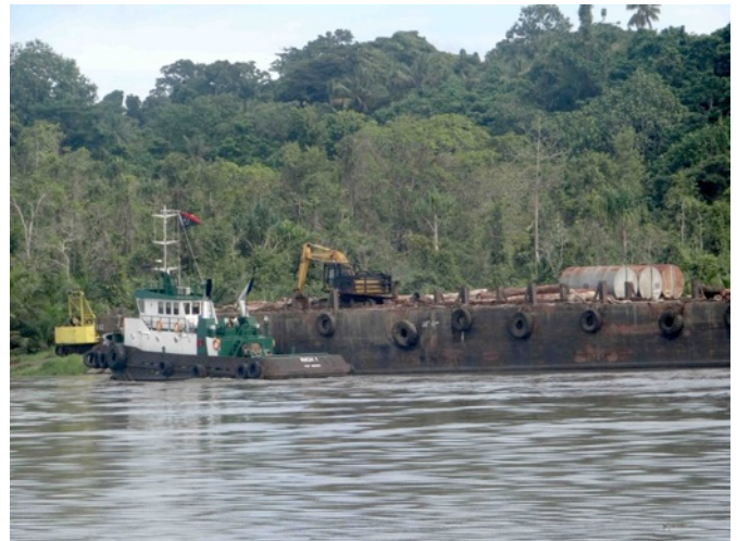
Malaysian timber operations at Marienberg

Some of the party pieces to be immortalized have been provided as an appendix to this diary. However it would be difficult to capture in full the hilarity of the Queen's Speech. There was a touching moment when the crew choir sang the PNG National Anthem. This concert, also featuring jokes, original verse and songs (many with a tone about aging), was all followed by dancing. The saloon kept rocking until midnight. As the party quietened down though it was discovered that a nameless person from the Surveyor wasn't capable of negotiating the gang-plank between the two vessels and he ended up on the floor under the kitchen table.