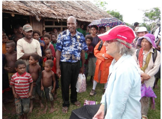
Swans Sapuka Football presentation

FL presented the HM with a parcel of school materials and Jacky tossed in a Swans Footy.