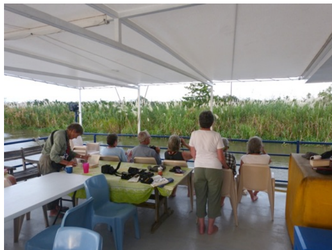
Birdwatching on Miss Rankin's back deck

The vegetation changed back to sago palms, cane grass and the inevitable water hyacinth (and some salvinia). Different from the island flora we had become accustomed to over the last week or so.