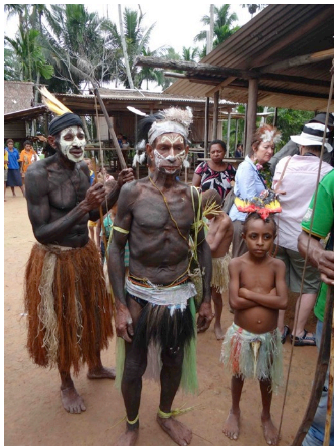
Kukujaba Sing-sing participants Day 4

Gorgeous red clouds with fabulous reflections. Another delicious dinner.