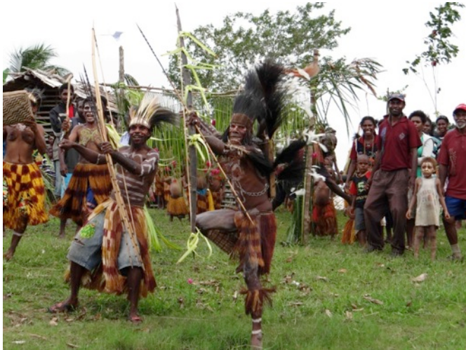
The Kuartru Reception team

enthusiasm. The only unfortunate observation was that there are still young children suffering from yaws, a fungal disease easily treated by modern anti-fungal cream.