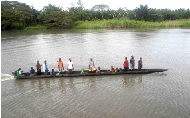
Marienberg delegation returning with supplies for the school.

Marienberg and Angoram with plans to amend in the morning.